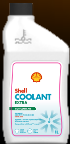
SHELL COOLANT EXTRA – WATER BASED AND GREEN IN COLOR- AVAILABLE IN 1L & 3L

In recognition of these problems, Shell is proud to present its new range of Coolants – Shell Coolant LongLife Plus and Shell Coolant Extra. Shell Coolants are based on superior Organic Additive Technology (OAT) that outperforms conventional coolants, so that customers can spend less time and money on repairs and more time on the road.