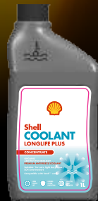
SHELL COOLANT LONGLIFE PLUS – MEG BASED AND RED IN COLOR- AVAILABLE IN 1L, 3L AND 10L